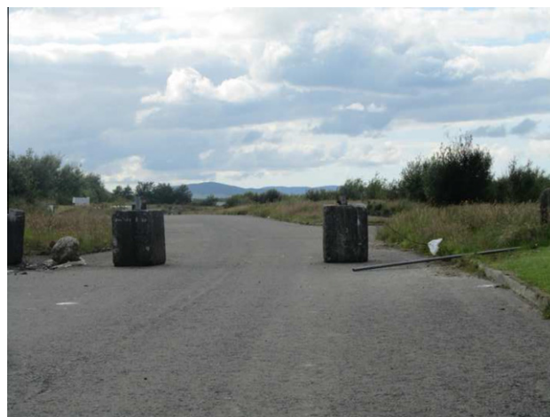
Fig. 6 An unapproved border crossing between Counties Derry/Londonderry and Donegal. The concrete blocks have been moved apart to allow vehicles to cross.

The future for the border is unclear. Officially the Republic of Ireland still wishes for Irish unity to take place and the British authorities would not stand against this if there was a clear majority of the Northern Ireland electorate who expressed such a desire. But given the financial costs which would be incurred from Irish unification and the realisation that it would almost certainly be accompanied by violence, there is at least tacit support in some quarters for the status quo to be maintained. Further, the Centre of Cross Border Studies published in August 2012 a statement from an unnamed senior Irish government official who opined that 'People in the South are utterly happy with its 26 county shape: their mental map is the 26 counties.' Additionally, there was a report on a telling confrontation on a television program between a young woman and Martin McGuinness, the Sinn Féin Deputy First Minister in the North who was standing for his party in the 2011 election for President of (the Republic of) Ireland. She said to him: