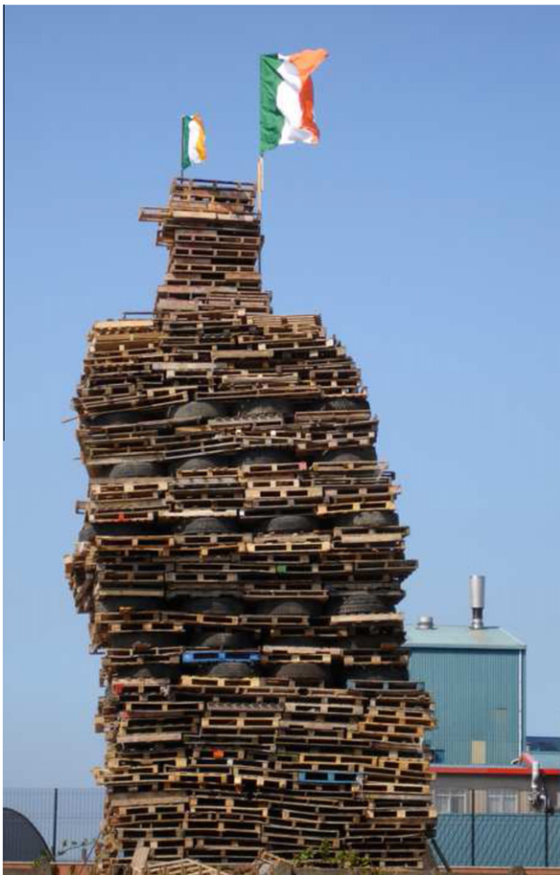
Fig. 2 An ‘eleventh night’ bonfire, Ormeau Embankment, Belfast. The Irish tricolors are flying not in celebration but because they will be burnt when the bonfire is lit.

1649 the English parliament sent Oliver Cromwell with his New Model Army to invade Ireland. After a brutal campaign almost all land still owned by Catholics was confiscated. A generation later Irish Catholics were involved in the Jacobite Rebellions, which attempted to restore the Catholic English King James II who had been replaced on the throne by the Protestant William of Orange in 1688. The former king entered Ireland with French assistance, Ireland indeed being a stepping stone into England it was hoped. King William came himself to Ireland to oppose James and there was an encounter in 1690, the Battle of the Boyne. The Protestants won, James fled back to France abandoning his supporters who were finally routed at the Battle of Aughrim in 1691 (Ó Ciardha, 2001). The Battle of the Boyne is still celebrated in Protestant areas of Northern Ireland with marches on 12 July and bonfires the night before (Fig. 2). After the defeat of the Jacobites, Ireland remained as a separately administered state if under the British sovereign and dominated by Great Britain. Local control was through a Protestant ruling class known as the Ascendancy. Resistance continued but was largely conducted through low-key activity led by rural groups such as the Whiteboys.