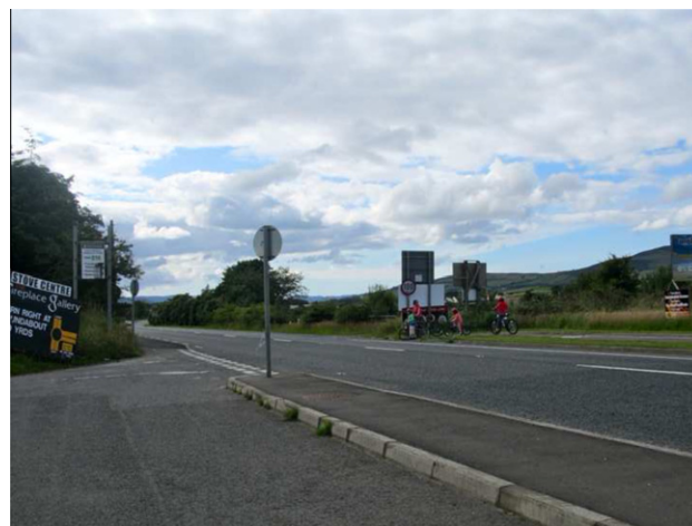
Fig. 5 The Irish border between Counties Derry/Londonderry and Donegal. The A2 in the foreground becomes the N13 on the border, which is about where the cyclists are crossing, by the sign marking the speed limit in kilometres per hour. Photograph by Stephen Royle, 15 July 2012.