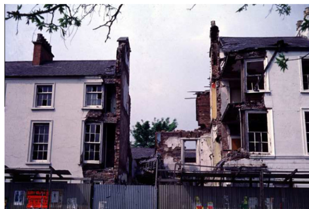
Fig. 1 Bomb damage during the Troubles, University Road, Belfast.

First it is necessary to reprise something of the history of Ireland, so its political division can be understood. The basic issue is geographical, namely Ireland's location just west of the much larger island of Great Britain. That location has always provided opportunities for Irish people who for centuries have migrated to Britain for work and residence. However, it has also been seen as Ireland's 'curse' as the nationalist leader Wolff Tone put it in 1798 shortly before he was sentenced to death for leading a rebellion against the British. The English and then, after the Act of Union in 1707 when Scotland joined England and Wales, the British, needed to control Ireland. There was always a fear that Ireland would be used as a stepping stone into Britain for that country's continental enemies, particularly the French and Spanish. Ireland had to be swept into the arms of England/Britain essentially to keep the latter nation safe. This policy can be traced back to 1169 when King Henry II of England mounted his first invasion of Ireland. Neither Henry nor his successors succeeded in gaining control of all of the island. The fourteenth century saw the depredations